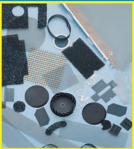
Filters and Screens