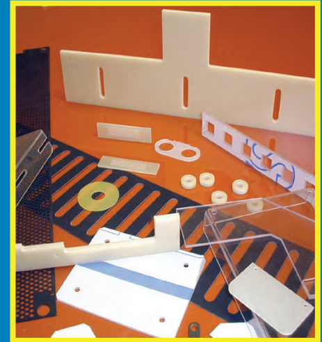
CNC Routed Plastics