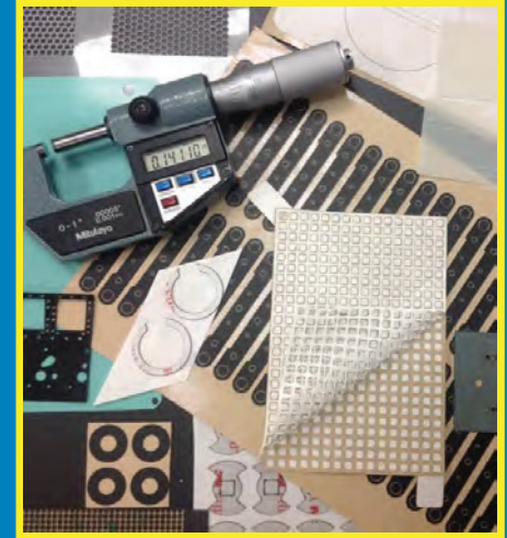
Laser Cut Parts