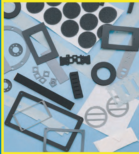
Gaskets and Seals