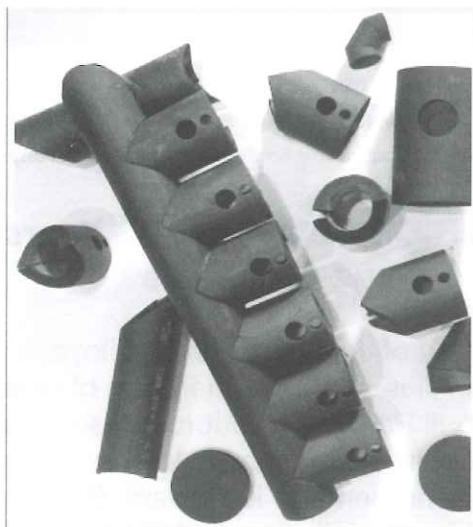
Flexible Insulation for HVAC & R Applications

ORION® designs and produces high quality insulation for all types of industrial, process tubing and pipe. We utilize Aerocel® tube and sheet insulation to fabricate a wide variety of shapes and assemblies. Aerocel is closed cell and effectively retards the flow of moisture. We custom cut standard shapes such as 90 degree, 45 degree and custom elbows, and can also fabricate tees, manifolds, and tubes with arc interface ends.